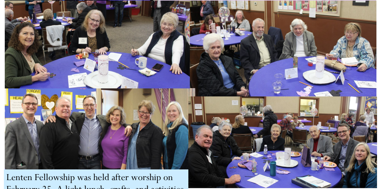
Lenten Fellowship was held after worship on February 25. A light lunch, crafts, and activities were enjoyed by all.