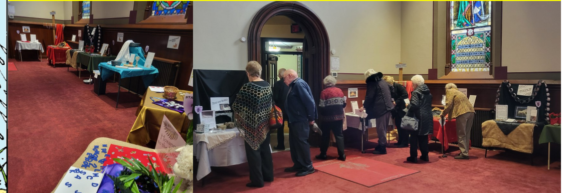
The 2024 Lent Prayer Stations were created by several Church Committees.